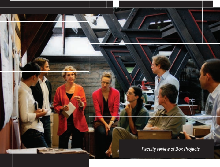
Faculty review of Box Projects

Taliesin the Frank Lloyd Wright School of Architecture is pleased to provide one of the most unique educational experiences available in higher education, designed for students who thrive in a multifaceted environment pursuing rigorous design, critical thinking, and hands-on learning. The small scale of the School facilitates a highly focused educational experience and fosters a close relationship between students, faculty, and staff. A progressive curriculum offers a variety of studios, classes, and projects.