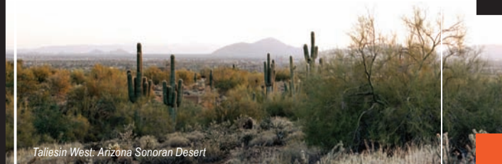
Taliesin West: Arizona Sonoran Desert

The Frank Lloyd Wright School of Architecture is a year-round program with a 12-month calendar. On-campus residency is required. The winter session (October–May) is at Taliesin West in Scottsdale, Arizona, and the summer session (May–October) is at Taliesin in Spring Green, Wisconsin.